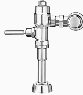
Variation Not Shown: Less Vacuum Breaker